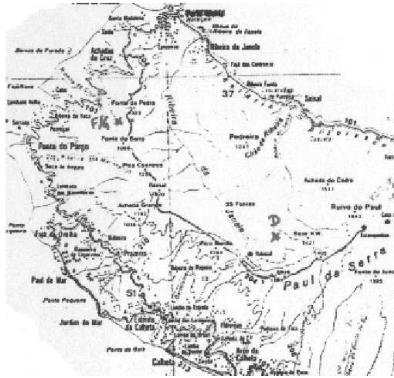
Figure 2: The two best sites at Madeira (only the western half of the island is shown): D and F/G. Any of these is great for radio astronomy (see text and Figure 3).