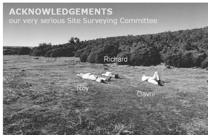
Figure 4: The three-expert committee for site selection at Madeira. The photo was taken at site D, on the 13th of May 1999. See Figures 2 and 3.